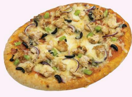
Spiced Chicken £16.00