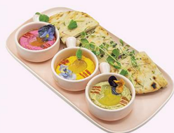
Hummus Trio v *Ask for gf