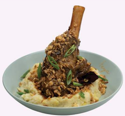
Lamb Shank With Mashed Potatoes £24.00