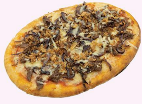
Pulled Beef £16.00