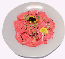
Pink Tortelloni Alfredo v £17.00