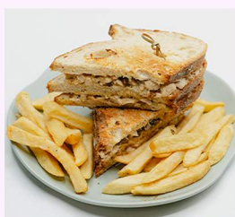
Truffle Chicken Mushroom