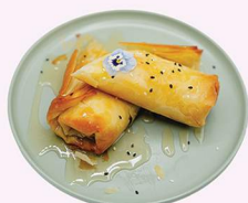
Baked Filo with Honey