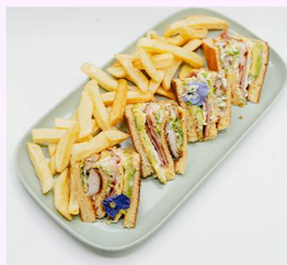
Deluxe Brioche Club Sandwich