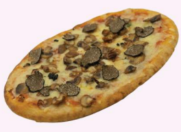
Mushroom & Truffle v £17.00