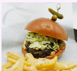
Grilled Halloumi Brioche