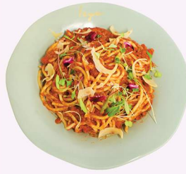
Spaghetti Bolognese £18.00