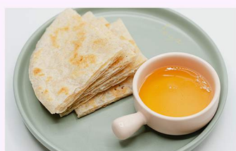
Soft Cheese with Honey