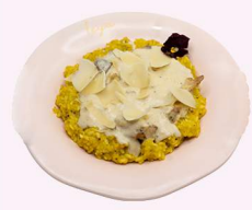
Saffron Risotto with Chicken A La Creme gf £18.00