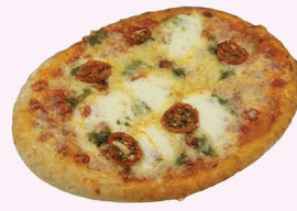
Margherita v £14.00