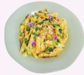
Creamy Chilli Penne v £17.00