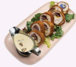
Cordon Bleu Chicken with Mushroom Sauce £18.00