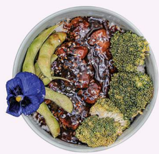
Teriyaki Chicken with Jasmine Rice gf £18.00