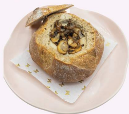
Creamy Mushroom in Sourdough