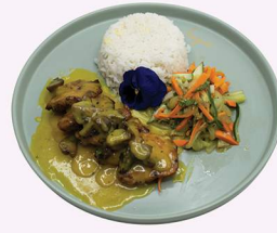
Tuscan Creamy Chicken With Garlic Rice gf £18.00