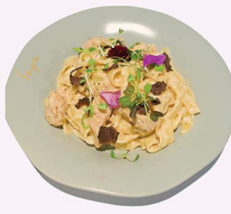
Chicken Tarragon Tagliatelle £18.00