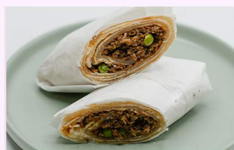
Minced Beef with Peas