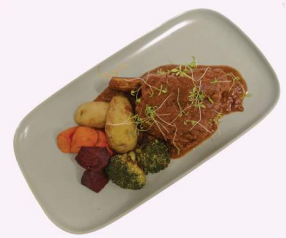
Slow Cooked Braised-Beef with Roast Vegetables gf £21.00