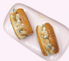
Garlic Butter Shrimp Brioche